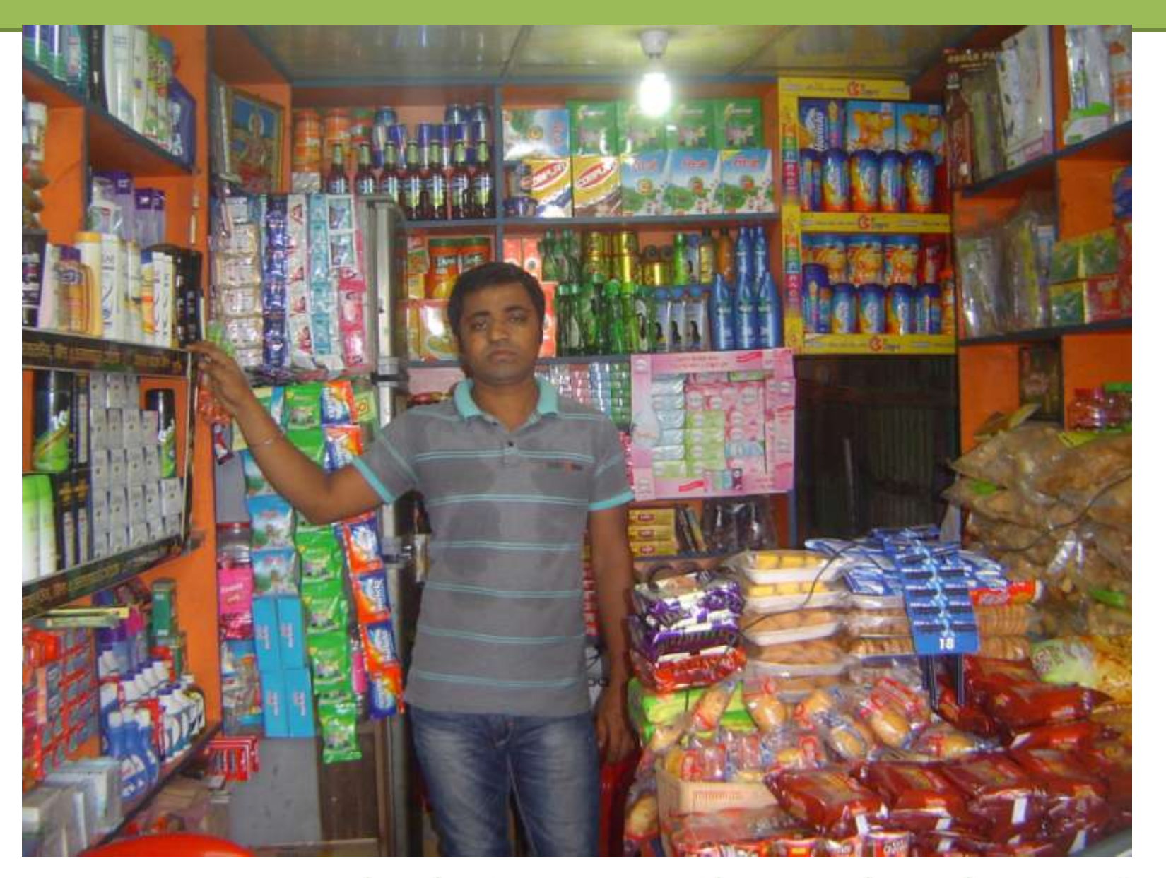
Grameen Shakti SamaJik Byabosha Ltd.