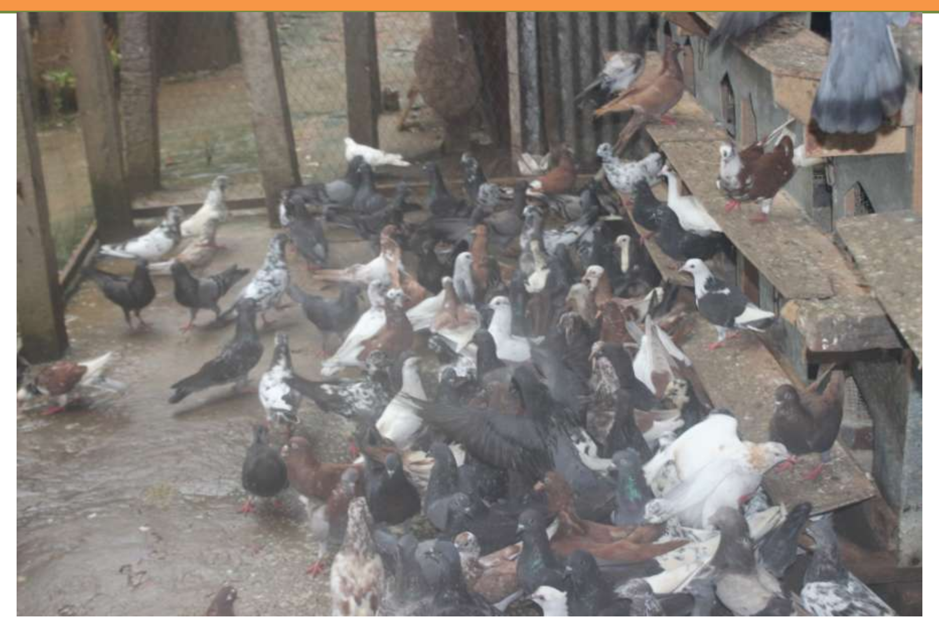
Grameen Shakti SamaJik Byabosha Ltd.